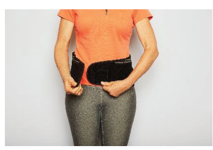
Wrap the left side to the front, positioning the front panel.