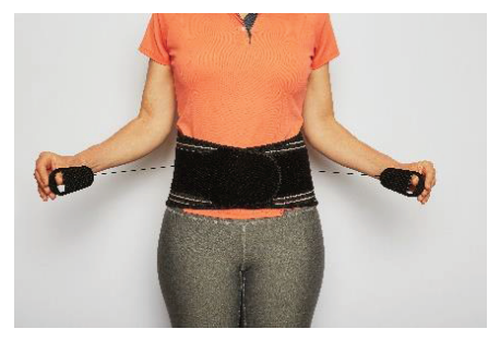
Pull dual pulley handles out and away to desired compression and support.