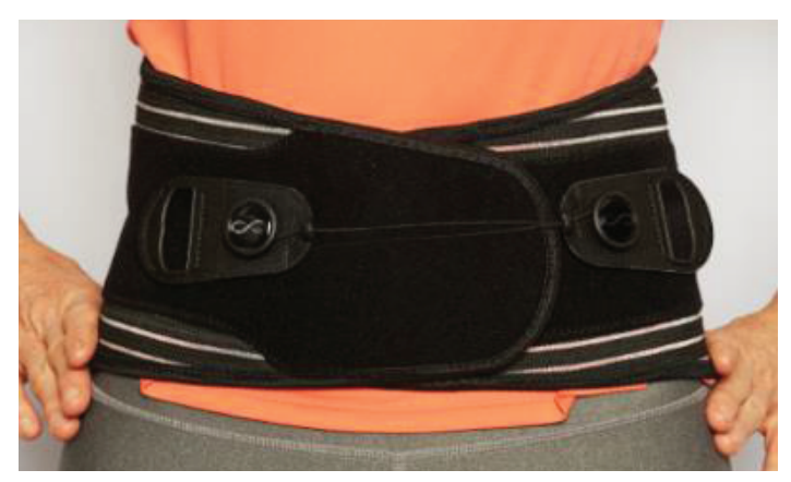
The Infiniti Comfort Compression Back Brace comfortably provides both superior compression and stabilization

Dual Handle Pulley System -XS thru 2XL (18"- 60" circumference)