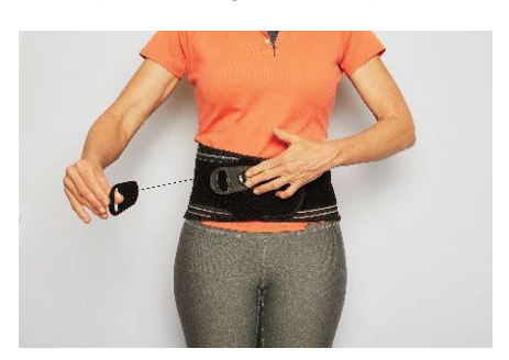
Place each handle on the fabric for a secure fit.