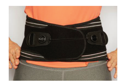
Adjust tension for sitting or standing.