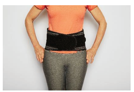
Then wrap right side on top of the left panel to close and attach in front.