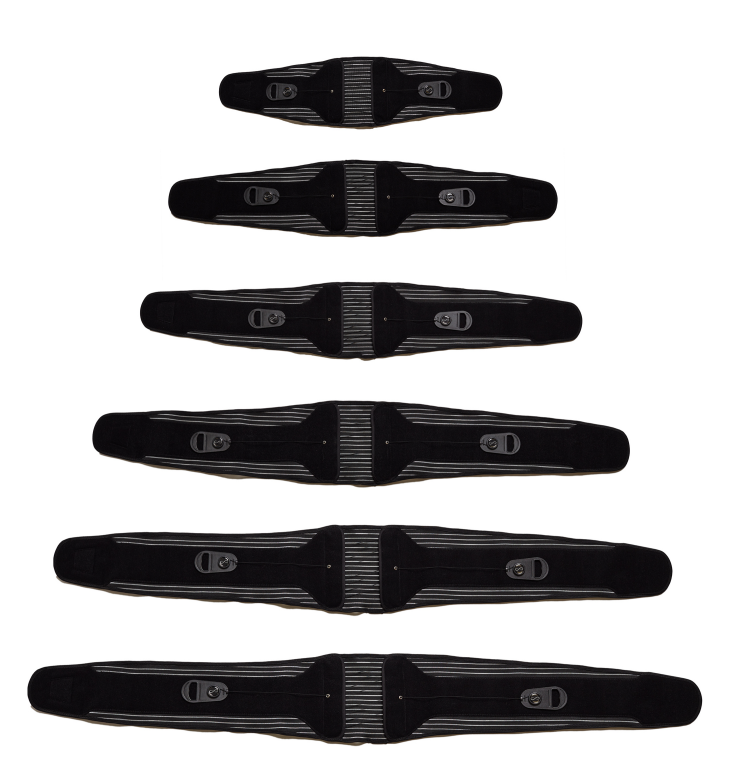
Easy to use flexible pulley system for maximum comfort and fit.

* Medical advice should be sought on the appropriateness and the condition under which any given spinal bracing system should be utilized.