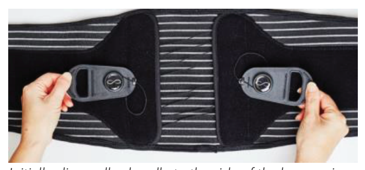
Initially align pulley handle to the side of the brace prior to each fitting.